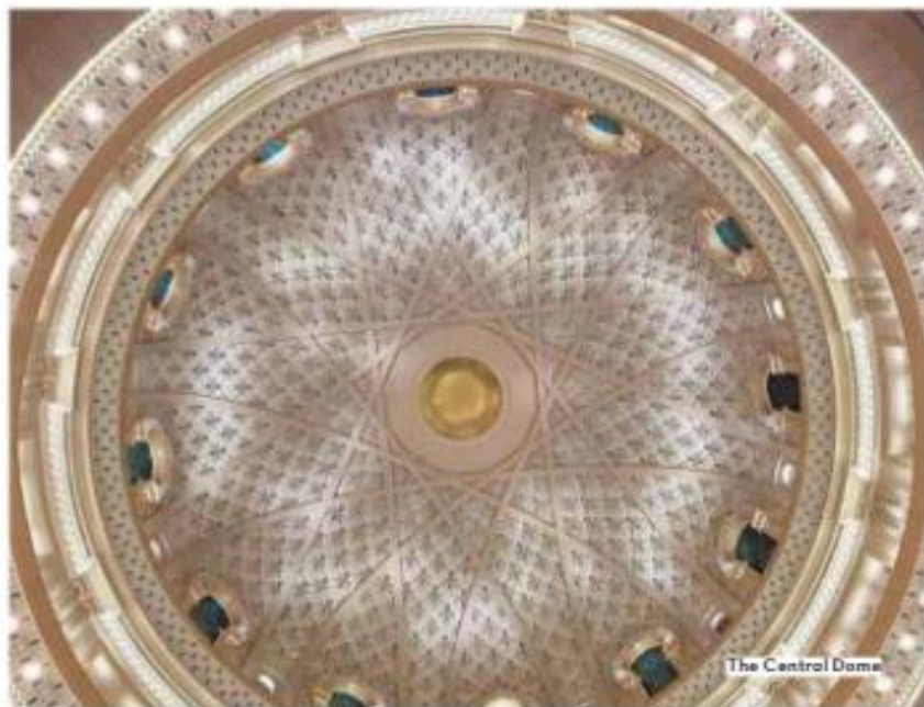
The Central Dome