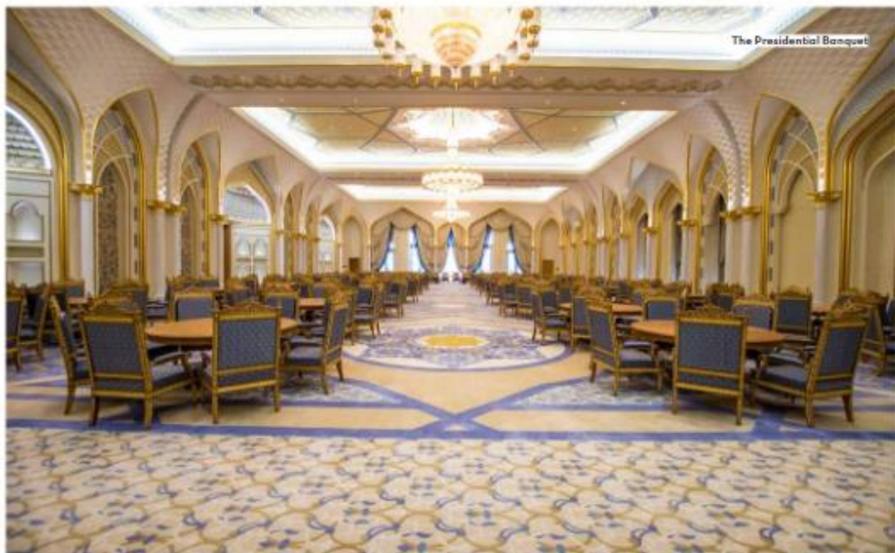
The Presidential Banquet

Xavier Cartron's scope of work also included the main reception building, supreme council, presidential library as well as the presidential wing.